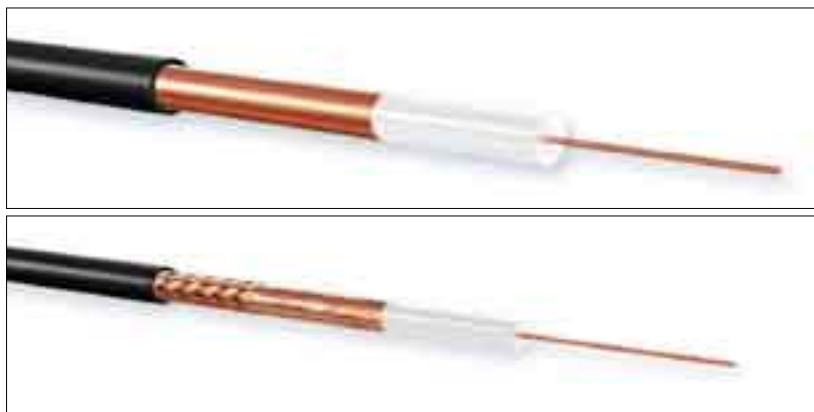
2YK2Y 1.1/7.3-75 2YTK2Y 1.1/7.3-75